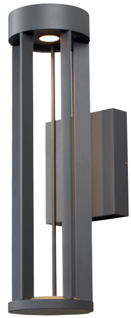
TURBO WALL shown in charcoal