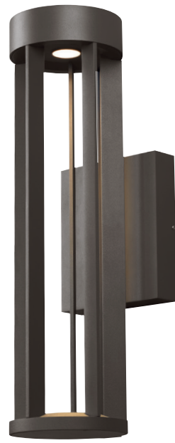
TURBO WALL shown in bronze