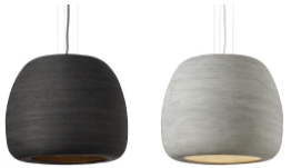
black / black large