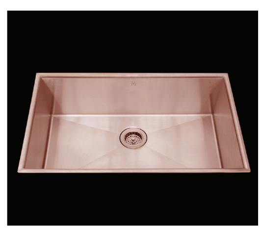
*Flush-Mount Installation Kit is included with each sink *Custom ADA compliant versions are available