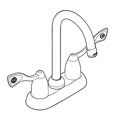
Two-Handle Bar Faucet

· Warranted for 5 years against material or manufacturing defects