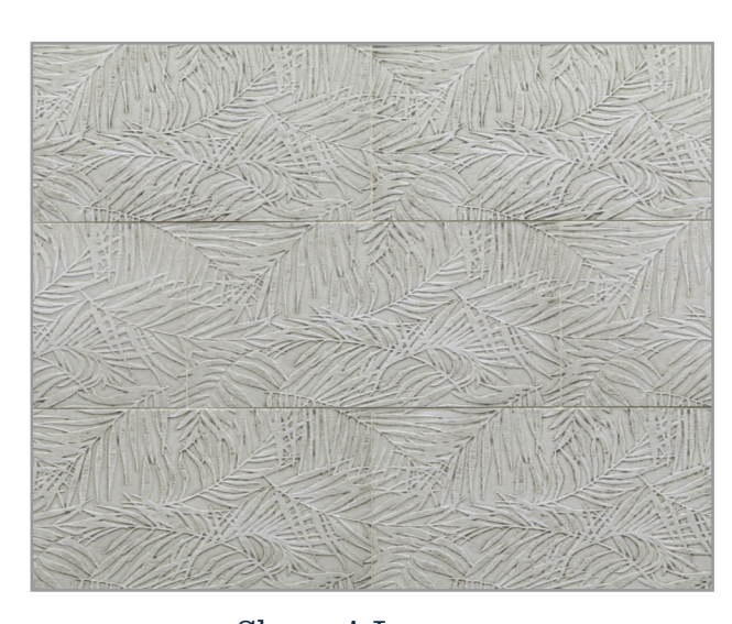
Shangri-La~(6\,x\,12) Wispy pattern of fern fronds conjure images of a tranquil paradise.