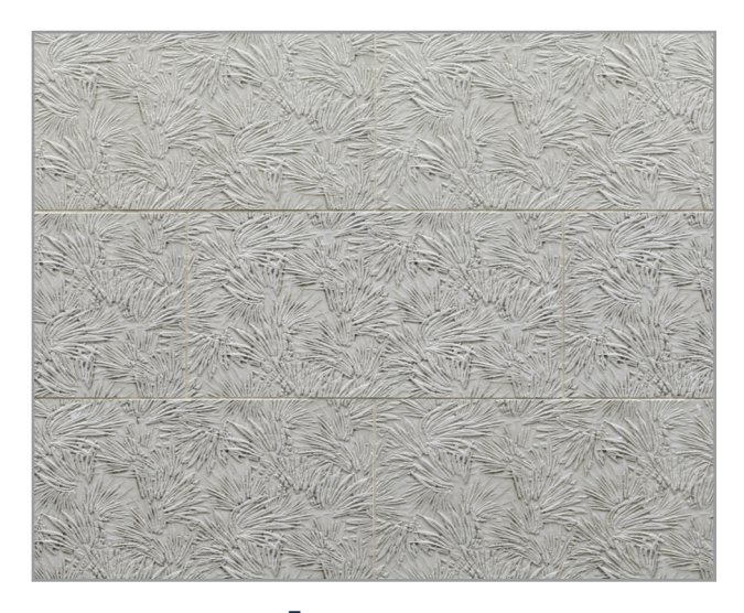
Lewa~(6~x~12) A breathtaking interpretation of tropical foliage.