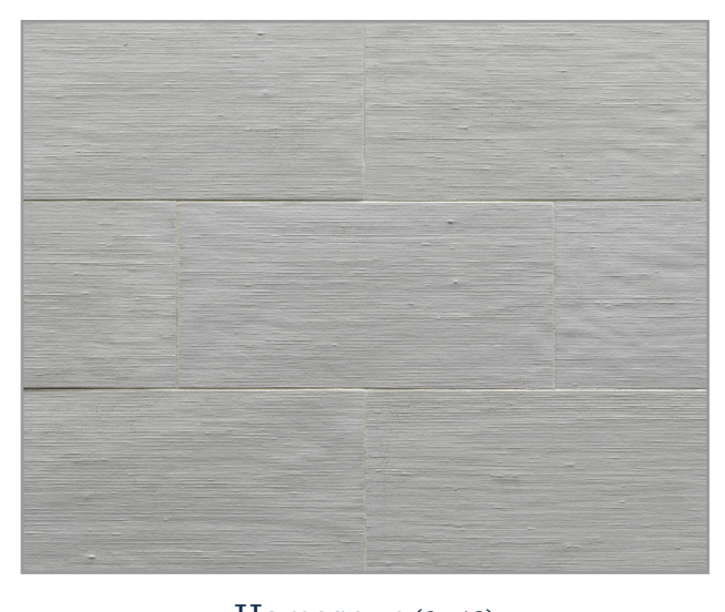
Homespun~(6~x~12) This softly textured, versatile tile is inspired by natural linen fabric.