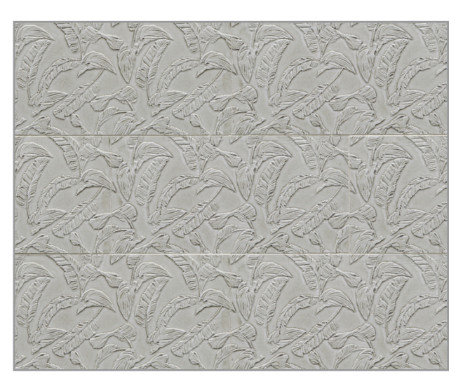
Palm\ Retreat\ (6 \times 12) Evokes the feeling of lush palms swaying in the breeze.