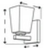
Image File Name: P5046-084-L.jpg