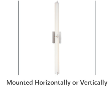
Mounted Horizontally or Vertically