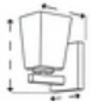
Image File Name: P5044-084.jpg