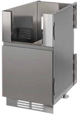
Fillers are adapted to the dimension of your burner

15" Grill Base Cabinet 1 door right hinges