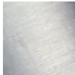
matte stainless steel

All dimensions in mm / inch = mm x 0,0394